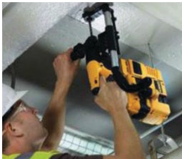
Worker drilling into concrete with a rotary hammer equipped with shroud and dust collection system. Note the shroud around drill bit, silver and black hose, and dust collector are attached conveniently to the drill.

The equipment shown in this picture is for illustrative purposes only and is not intended as an endorsement by OSHA of this company, its products or services.