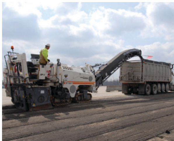
Milling machine milling asphalt road and loading debris into haul truck.

Respiratory protection is not required for work with small drivable milling machines (less than half-lane) regardless of task duration.