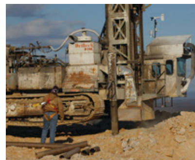
Vehicle-mounted drilling rig using water on the drill bit. The enclosed operator's cab is on the right.

Respiratory protection is not required for work with vehicle-mounted drilling rigs regardless of task duration.