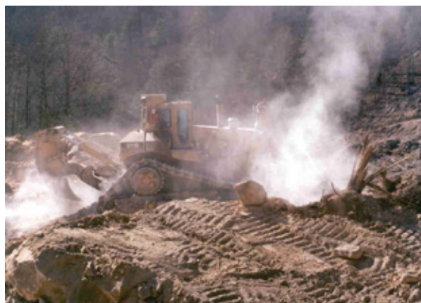
Earthmoving using a dozer equipped with enclosed operator cab.

Respiratory protection is not required for work with heavy equipment when it is operated from within an enclosed cab, or when water or other dust suppressants are used, regardless of task duration.