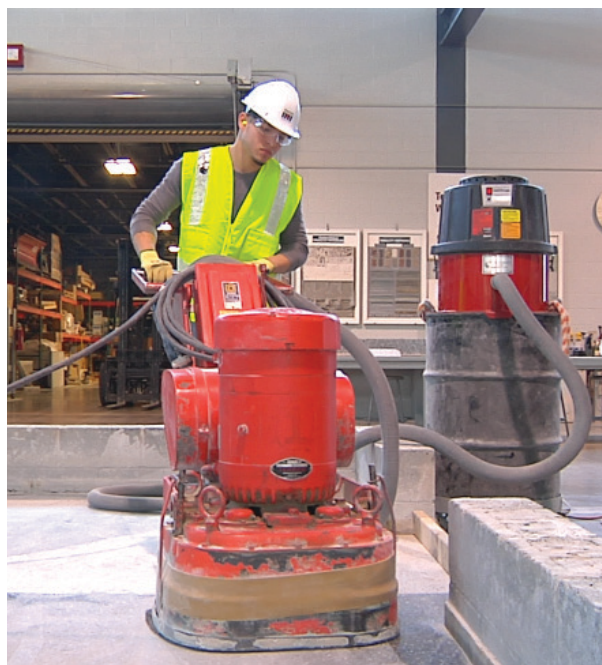
Worker milling granite floor indoors with milling machine and dust collection system (background).

Respiratory protection is not required for work with walk-behind milling machines and floor grinders regardless of task duration.