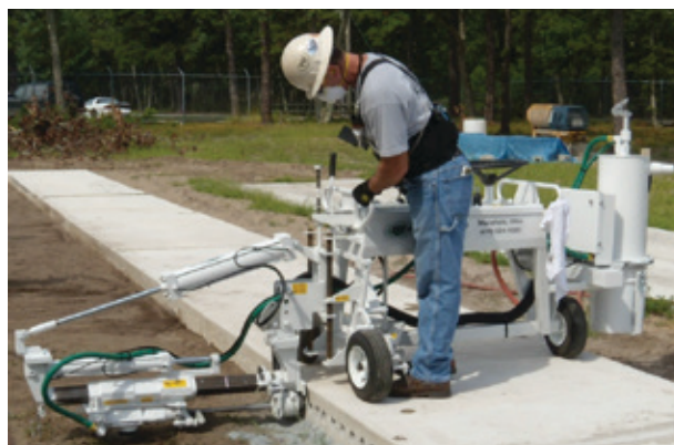
Worker drilling horizontal holes in concrete slab with a dowel drilling rig. The shroud surrounds the drill steel where it enters the concrete and the dust collector is the canister on the right. Worker is wearing respiratory protection.

Respiratory protection with a minimum APF of 10 is required for all work with dowel drilling rigs for concrete regardless of task duration.