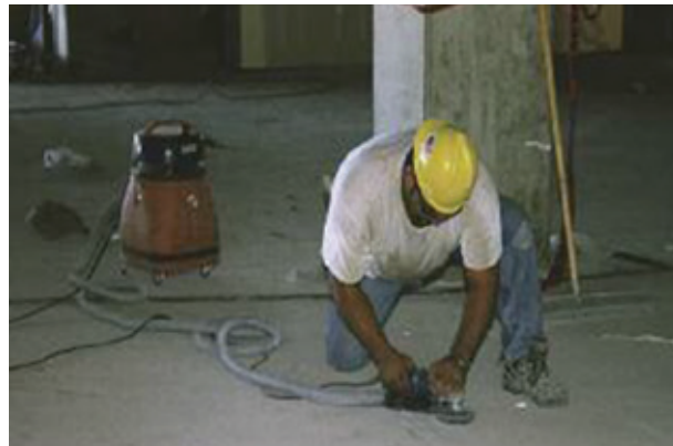
Worker grinding concrete floor with grinder attached to dust collector (background).

When using handheld grinders indoors or in enclosed areas (areas where airborne dust can buildup, such as a structure with a roof and three walls), employers must provide additional exhaust as needed to minimize the accumulation of visible airborne dust. See the section on Indoors or Enclosed Areas for more information.