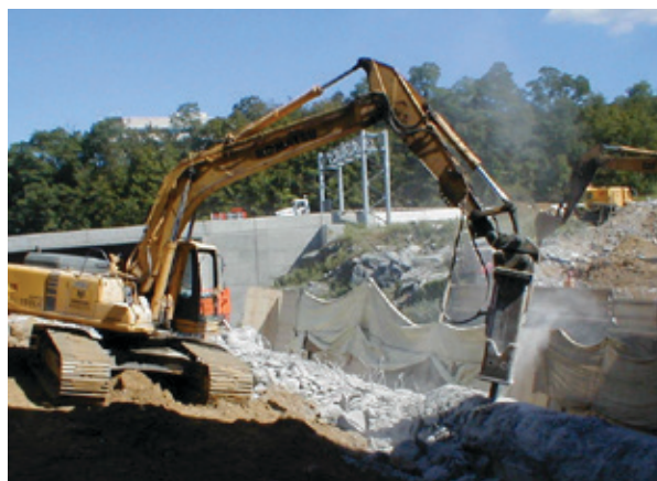
Excavator equipped with an enclosed cab and hoe-ram demolishing a concrete wall.

NOTE: When the operator exits the enclosed cab and is no longer actively performing the task, the operator is considered to have stopped the task. However, if other abrading, fracturing, or demolition work is performed by other heavy equipment and utility vehicles in the area while an operator is outside the cab, that operator is considered to be an employee “engaged in the task” and must be protected by the application of water and/or dust suppressants.