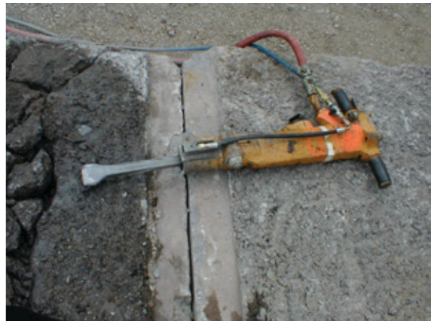
Jackhammer equipped with water spray delivery system to control dust. The water nozzle is mounted on the jackhammer frame just to the right of the chisel. Note the wet concrete on left from the water spray.

When working indoors or in an enclosed space (areas where airborne dust can buildup, such as a structure with a roof and three walls), employers must provide additional exhaust, as needed to minimize the accumulation of visible airborne dust. See the section on Indoors or Enclosed Areas for more information.