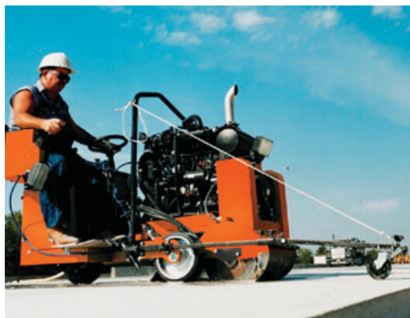
Worker cutting a groove in concrete roadway with drivable saw using integrated water delivery system.

Respiratory protection is not required for work with drivable saws regardless of task duration.