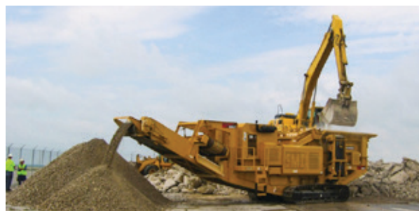
Crushing machine being loaded with construction debris by an excavator

Respiratory protection is not required for crusher operators regardless of task duration.