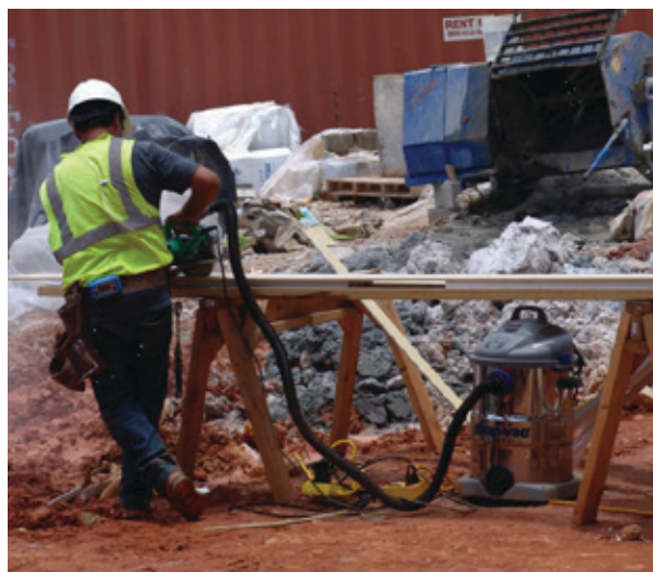
Worker cutting fiber-cement board outdoors using a handheld power saw and dust collection system. The dust collection system consists of the shroud on the saw, hose, and dust collector positioned between the saw horses.

Respiratory protection is not required for work outdoors with specialty handheld power saws while cutting fiber-cement board regardless of task duration.