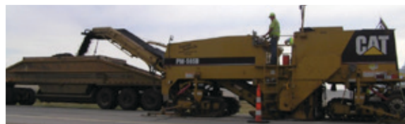
Milling machine milling asphalt road and loading debris into a haul truck.

Respiratory protection is not required for work with large drivable milling machines (half-lane or larger) regardless of task duration.