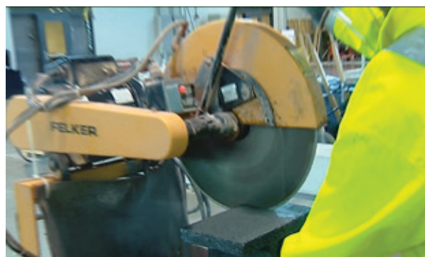
Worker cutting masonry block on a stationary masonry saw equipped with integrated water delivery system that continuously feeds water to the blade. Note water supply hose attached to top of shroud around blade.

Respiratory protection is not required for work with stationary masonry saws regardless of task duration.