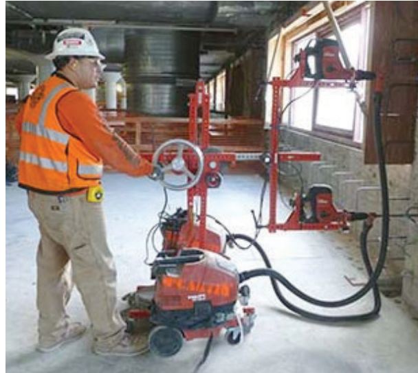
Worker is drilling horizontal holes in a concrete wall using two stand-mounted drills, each equipped with a dust collector. Note the shrouds around drill bits, black hose, and dust collector are attached to the stand.

Respiratory protection is not required when using handheld or stand-mounted drills equipped with a dust collection system, including for overhead drilling, regardless of task duration.