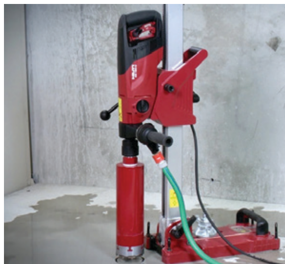
A rig-mounted core drill with an integrated water delivery system.

Respiratory protection is not required for work with rig-mounted core saws or drills regardless of task duration.