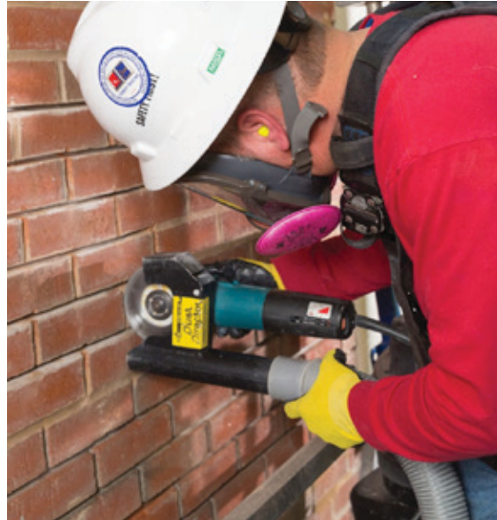
Worker grinding mortar from between bricks with a handheld grinder equipped with a shroud and dust collection system. In addition, worker is using respiratory protection.

Respiratory protection with a minimum APF of 10 is required for work with handheld grinders for mortar removal lasting four hours or less in a shift. Respiratory protection with a minimum APF of 25 is required for work lasting more than four hours per shift.