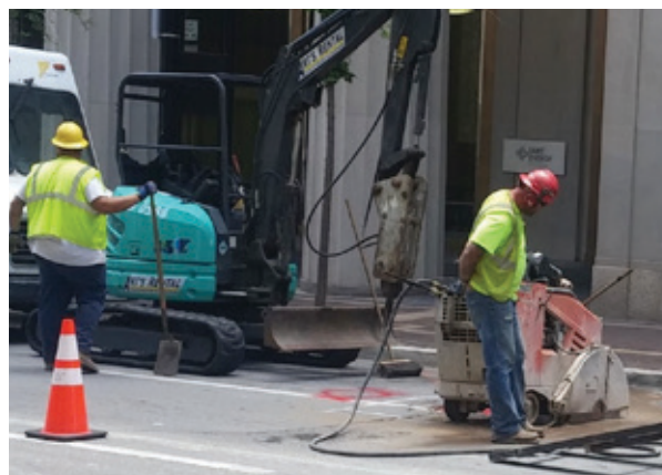
Worker using a walk-behind saw with an integrated water delivery system to cut asphalt roadway.

When working outdoors, respiratory protection is not required for work with walk-behind saws regardless of task duration. When working indoors, or in an enclosed location, respiratory protection with a minimum APF of 10 is required regardless of task duration.